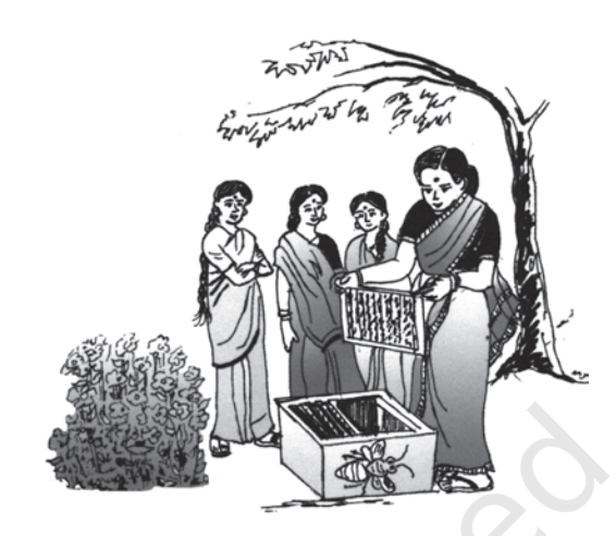
Fig. 6.5 Women in rural households take up beekeeping as an entrepreneurial activity

harvesting, nursery maintenance, hybrid seed production and tissue culture, propagation of fruits and flowers and food processing are highly remunerative employment options for women in rural areas.