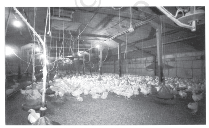
Fig. 6.4 Poultry has the largest share of total livestock in India

Horticulture: Blessed with a varying climate and soil conditions. India has adopted growing of diverse horticultural crops such as fruits, vegetables, tuber crops, flowers, medicinal and aromatic plants, spices and plantation crops. These crops play a vital role in providing food and nutrition, besides addressing employment concerns. Horticulture sector contributes nearly one-third of the value of agriculture output and six per cent of Gross Domestic Product of India. India has emerged as a world leader in producing a variety of fruits like mangoes, bananas, coconuts, cashew nuts and a number of spices and is the second largest producer of fruits and vegetables. Economic condition of many farmers engaged in horticulture has improved and it has become a means of improving livelihood for many unprivileged classes. Flower