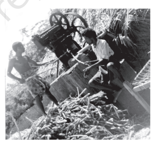
Fig. 6.2 Jaggery making is an allied activity of the farming sector

As agriculture is already overcrowded, a major proportion of the increasing labour force needs to find alternate employment opportunities in other non-farm sectors. Non-farm economy has several segments in it;