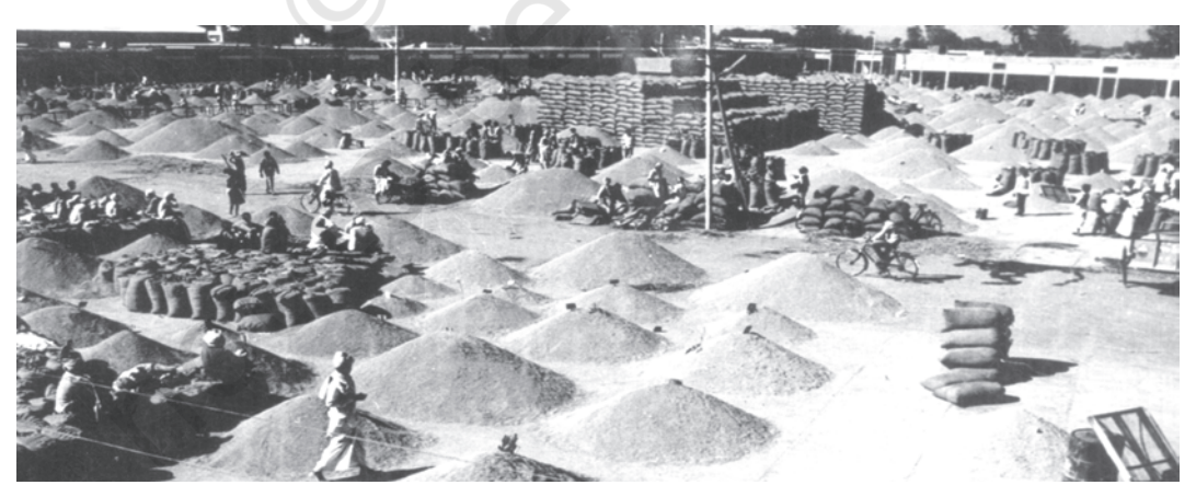
Fig. 6.1 Regulated market yards benefit farmers as well as consumers

Let us discuss four such measures that were initiated to improve the marketing aspect. The first step was regulation of markets to create orderly and transparent marketing conditions. By and large, this policy benefited farmers as well as consumers. However, there is still a need to develop about 27,000 rural periodic markets as regulated market places to realise the full potential of rural markets. Second component is provision of physical infrastructure facilities like roads, railways, warehouses, godowns, cold storages and processing units. The current infrastructure facilities are quite inadequate to meet the growing demand and need to be improved. Cooperative