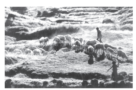
Fig. 6.3 Sheep rearing — an important income augmenting activity in rural areas

followed by others. Other animals which include camels, asses, horses, ponies and mules are in the lowest rung. India had about 300 million cattle, including 108 million buffaloes in 2012. Performance of the Indian dairy sector over the last three decades has been quite impressive. Milk production in the country has increased by about ten times between 1951-2016. This can be attributed mainly to the successful implementation of 'Operation Flood'. It is a system whereby all the farmers can pool their milk produced according to different grading (based on quality) and the same is processed and marketed to urban centres through cooperatives. In this system the farmers are assured of a fair price and income from the supply of milk to urban markets. As pointed out earlier Gujarat state is held as a success story in the efficient implementation of milk cooperatives which has been emulated by many states. Gujarat, Madhya Pradesh, Uttar Pradesh. Andhra Pradesh. Maharashtra, Punjab and Rajasthan, are major milk producing states. Meat,